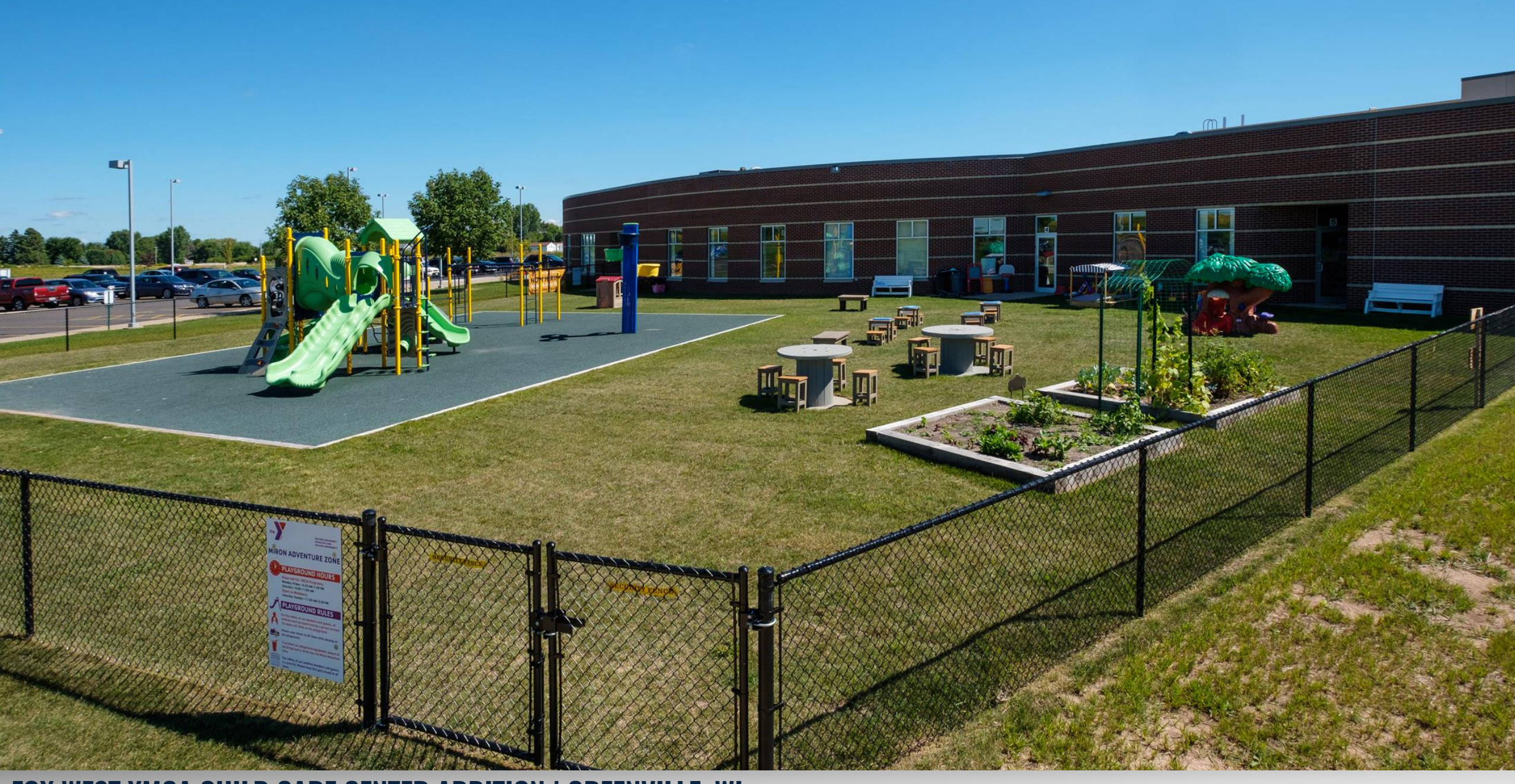
FOX WEST YMCA CHILD CARE CENTER ADDITION | GREENVILLE, WI