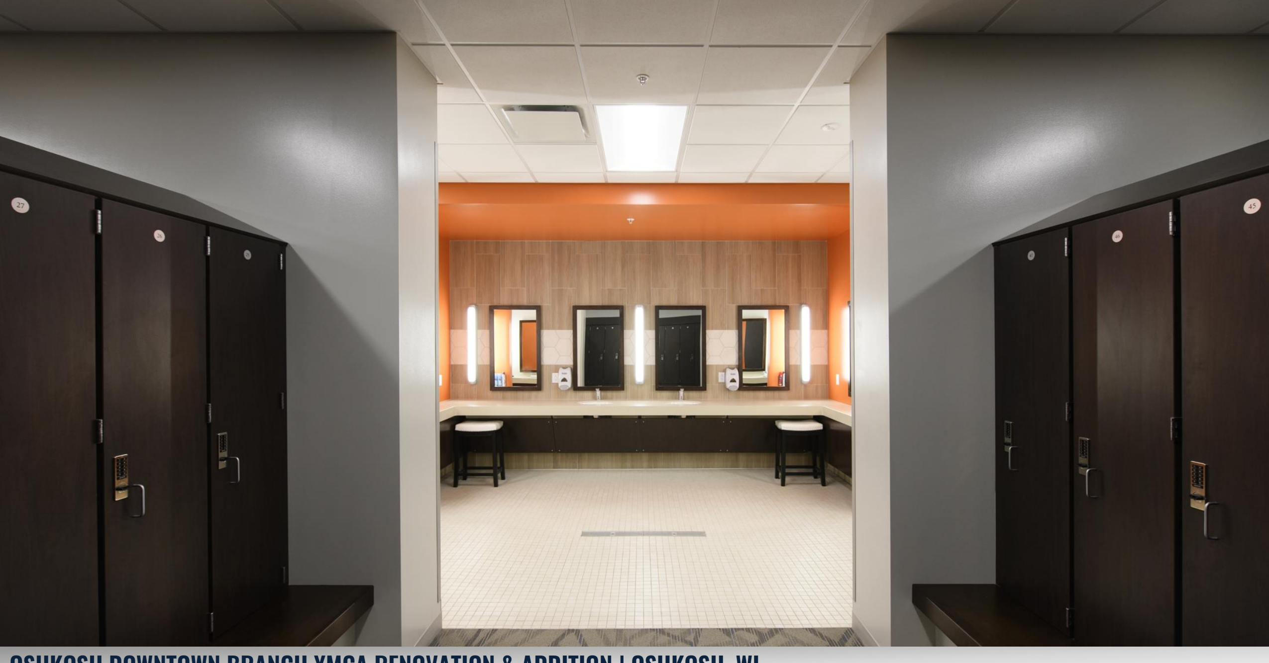
OSHKOSH DOWNTOWN BRANCH YMCA RENOVATION & ADDITION | OSHKOSH, WI